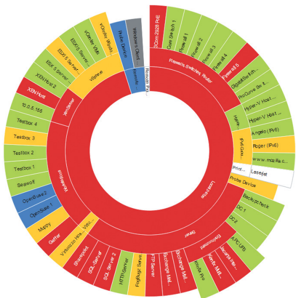
The 'sunburst view' shows the status of the whole network on a single screen.

Systematic network monitoring helps prevent outages, optimize networks, and improve services: Save time and money!